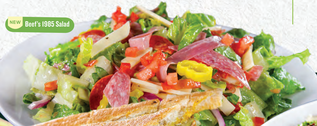
NEW Beef's 1985 Salad