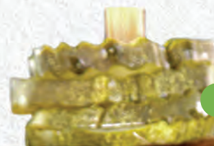
The 'O' Brady™ Burger