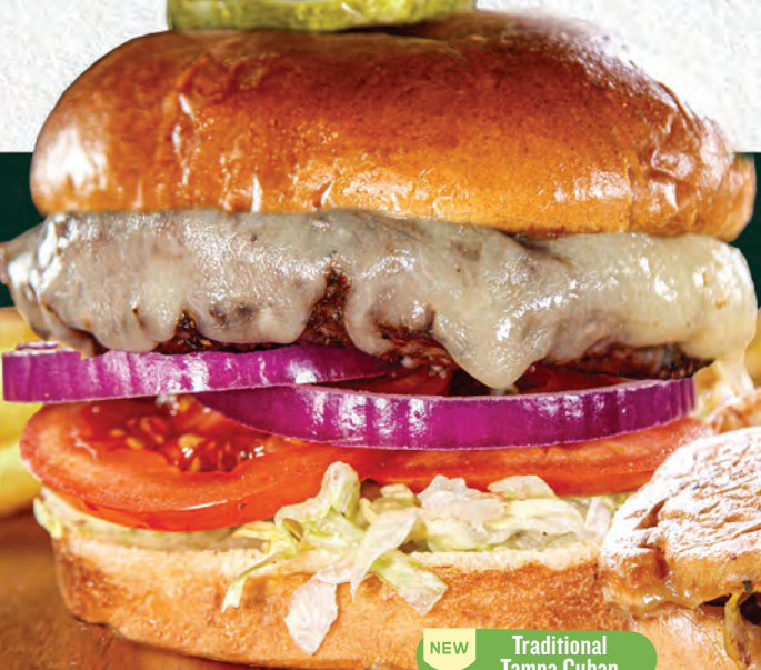
NEW Traditional Tampa Cuban